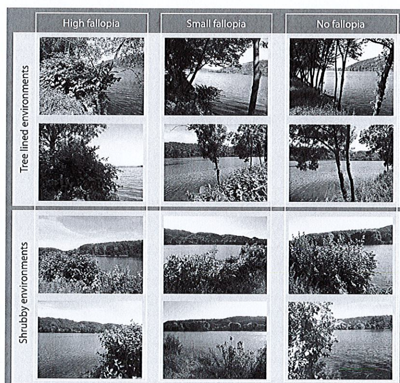
Fig. 1 Photographs used for the photoquestionnaire. Photographs were taken along the Rhône River; any anthropic elements were removed

distributed between the five age categories that composed each sample ( \chi^2(9) = 3.95 , NS).