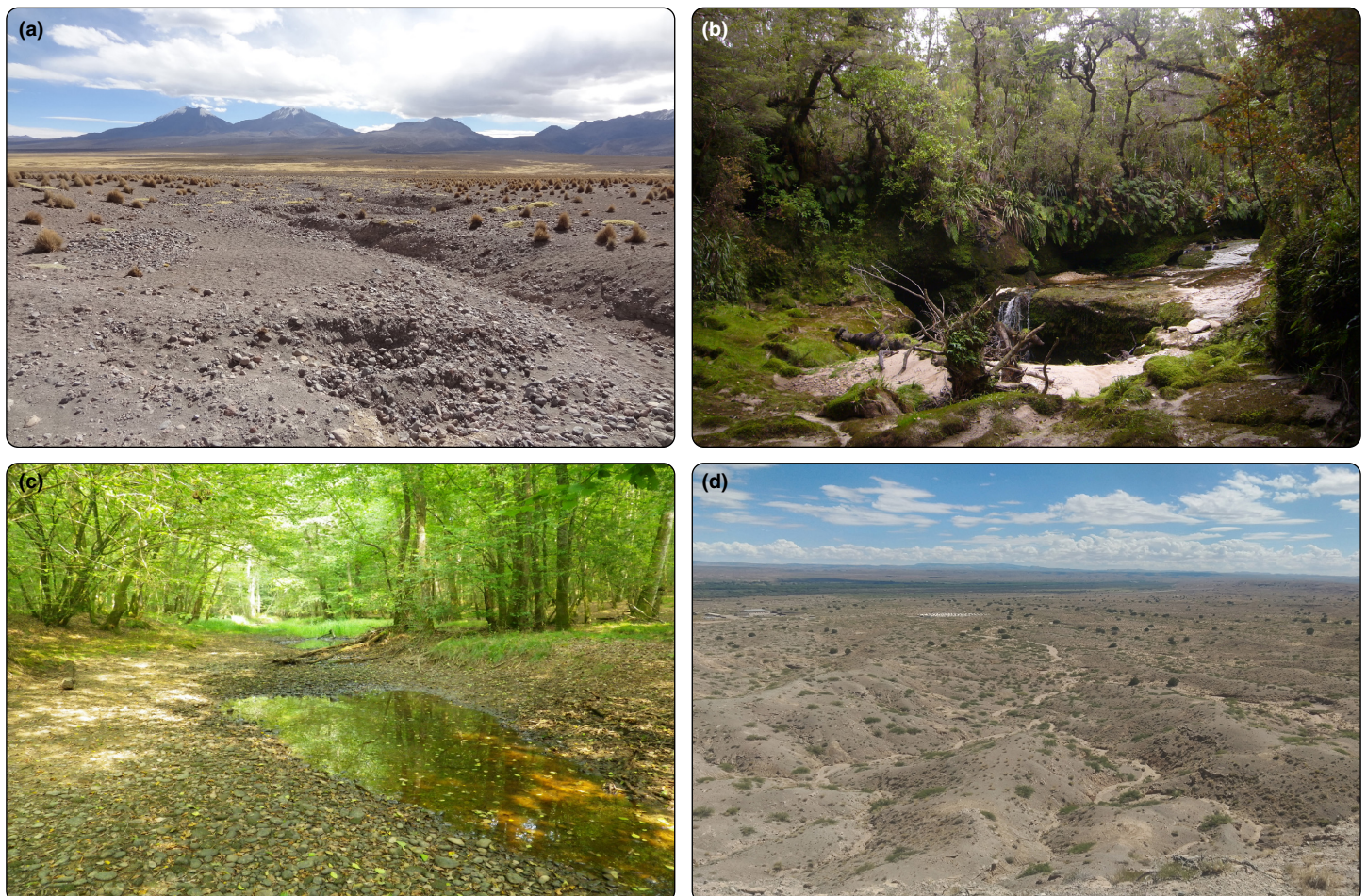
Figure 1. Examples of intermittent rivers and ephemeral streams (IRES) across different continents and climates. (a) Rio Chaki, Bolivia; (b) unnamed stream, New Zealand; (c) La Clauge, France; (d) Sevilleta National Wildlife Refuge, New Mexico.

This review highlights key processes that require further understanding of IRES and details how the application of innovative genetic methods could substantially increase our understanding at three levels: populations and communities at