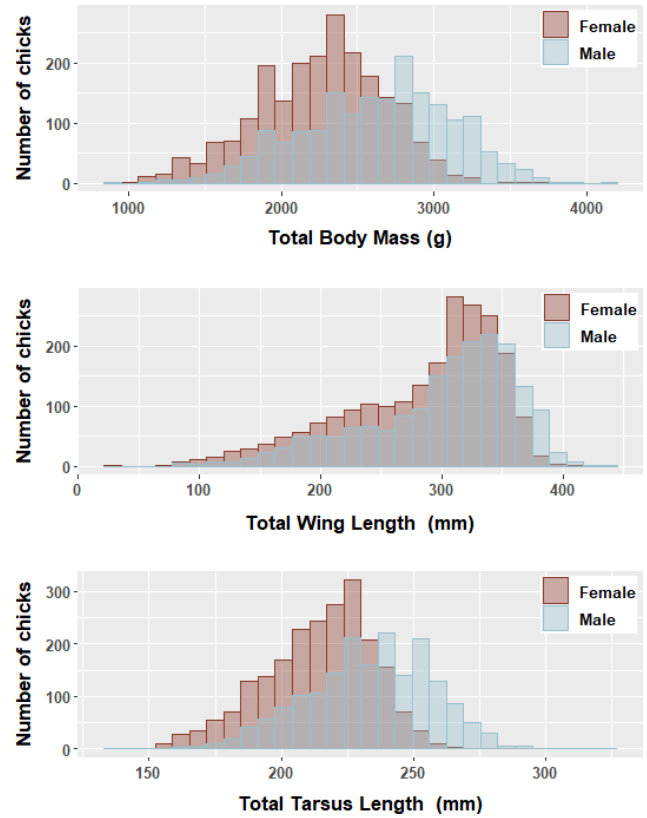
Figure 1. Mean (body mass, tarsus and wing length) of male and female greater flamingo chicks banded at Camargue, during 11 breeding seasons (1995–2008, except 2001, 2002 and 2007).

(males were larger than females ( t = 33.7 , p < 0.000^{***} )), and the mean difference index (MDI = 100 \times mean female/mean male; Delestrade, 2001; Helfenstein et al., 2004) was < 95\% for all characters (Table 2). Pooling all years, the largest difference occurred in body weight (males being 1.1 times heavier than females, Cohen's d = 0.8 ). Dimorphism in tarsus length was also important for all years (ratio male / female = 1.1, Cohen's d = 0.9 and was less important for wing length (ratio male / female = 1.0, Cohen's d = 0.3 ; Table 2; Fig. 1).