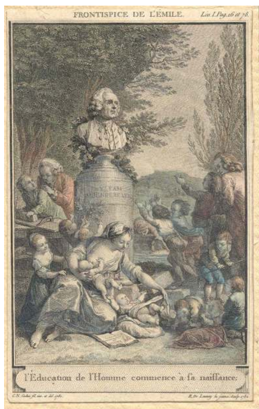
Figure 1: Frontispiece of Rousseau's Emile (1782), engraved by Robert de Launay after an original by Charles Nicolas II Cochin.