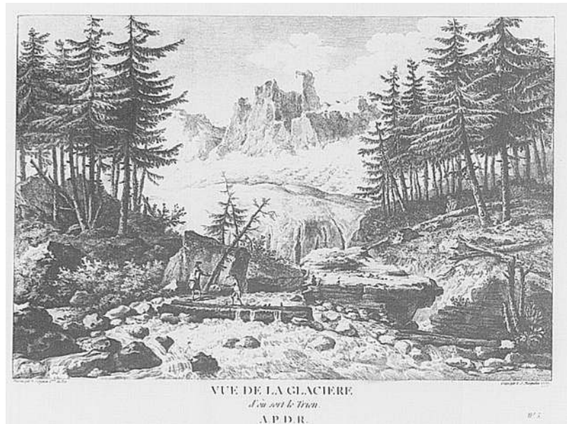
Figure 3: View of the glacier where the river of Trient emerges, engraved by L. J. Masquelier after an original by N. Perignon for La Borde and Zurlauben (1780–1786).

While recognizing the importance of sight within the esthetic and cultural framework of the picturesque, we should also note the other sensory landscape experiences that Lortet confided to her reader on several occasions. Her experience of walking is sensuous when