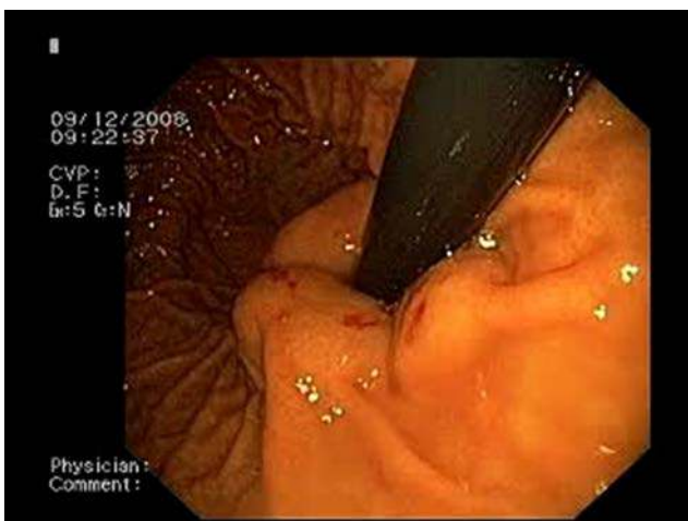
Fig. 2 HA injection

IGB placement and HA injection were performed under unconscious sedation, and IGB extraction was performed under deep sedation with tracheal intubation 6 months after balloon placement. Proton pump inhibitors were given for 3 weeks after IGB implantation. The Orbera™ system (Allergan Inc., Irvine, CA, USA) water-filled