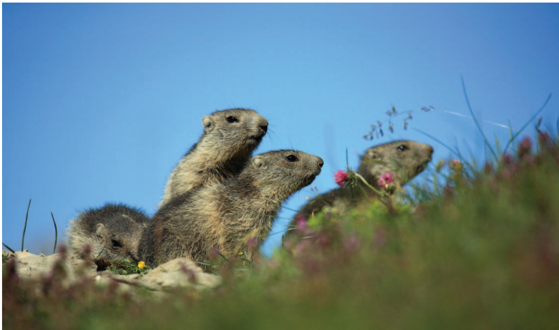
Alpine marmot subordinates playing at Grande Sassièrre nature reserve (French Alps).