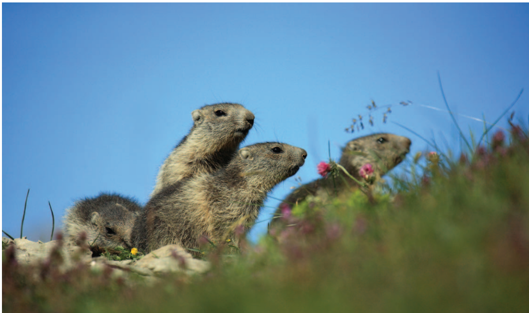
Alpine marmot subordinates playing at Grande Sassièrre nature reserve (French Alps).