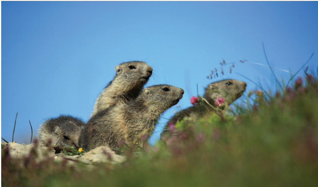
Alpine marmot subordinates playing at Grande Sassièrre nature reserve (French Alps).