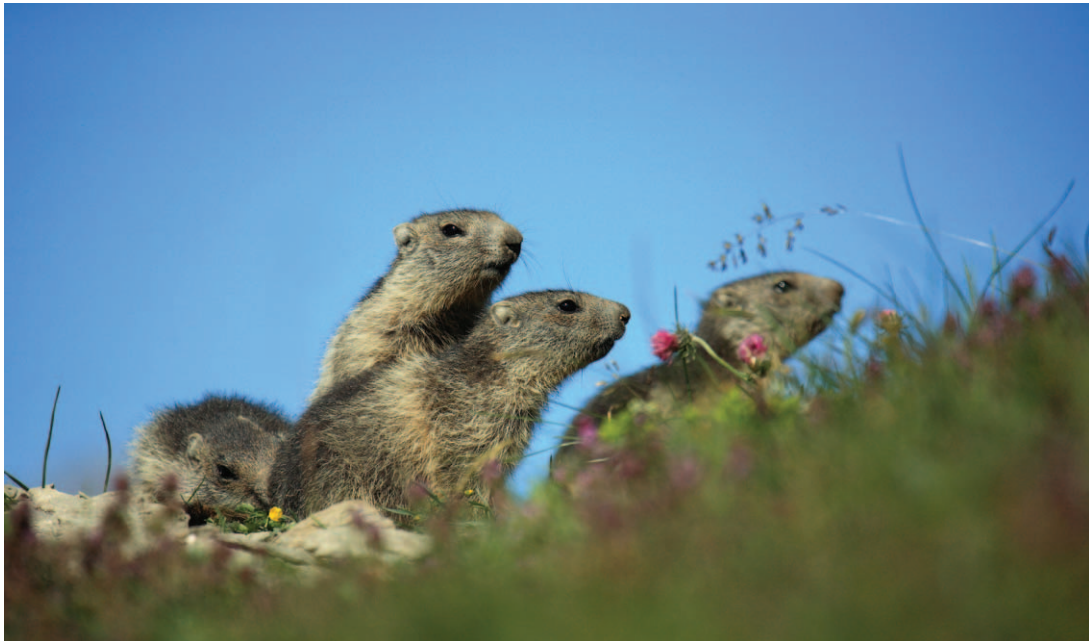
Alpine marmot subordinates playing at Grande Sassi re nature reserve (French Alps).